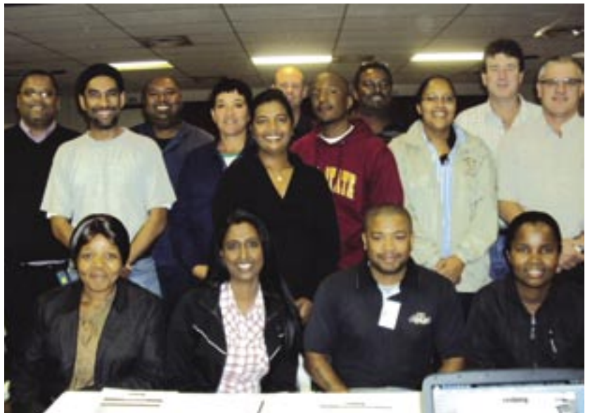
Representatives of various companies recently underwent HIV Management Training as part of the CARE programme. The main objective of the training is to enable the managers to understand the pandemic better in order to support their employees more effectively.