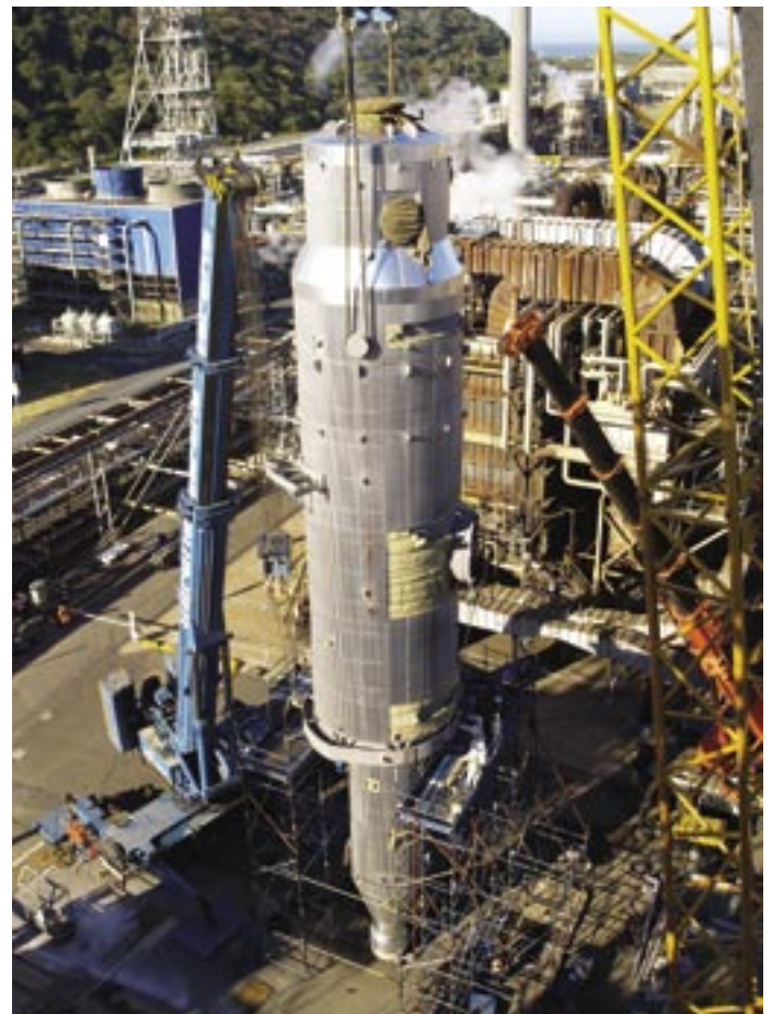
Another integrity related project undertaken in last year's major Turnaround was the replacement of the reactor on the catcracking unit.