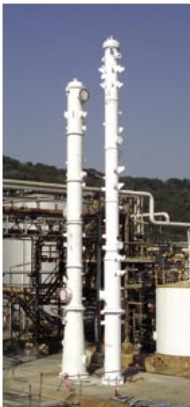
Two new columns to be installed in the alkylation unit.

He goes on to say: “We have a technique for identifying which areas need attention and these are scheduled into a plan two or three years ahead. Apart from the routine maintenance and inspection done during a Turnaround, the opportunity is normally taken to execute project work while certain units are shut down.”