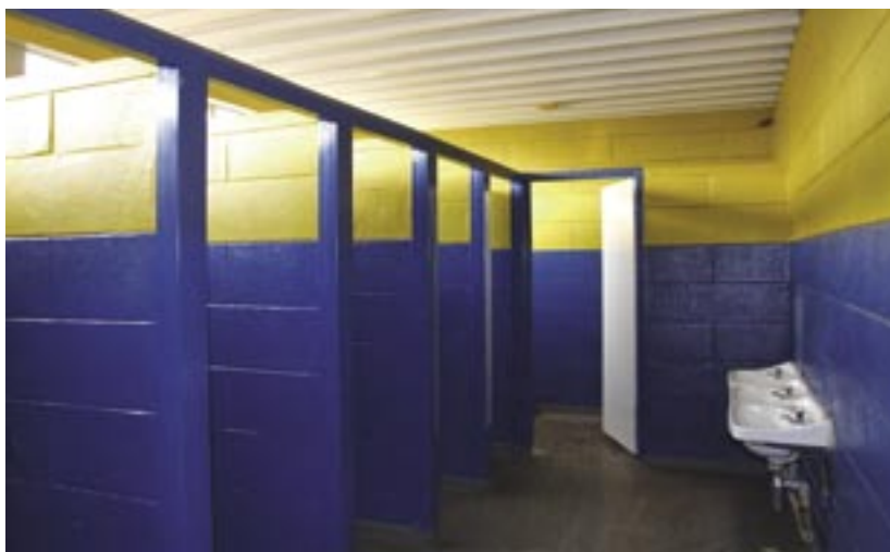
SAPREF has upgraded the ablution facilities at Durban East Primary School in Wentworth as part of their schools upliftment initiative which commenced in 2009.

The next phase is replacing broken window panes, repairing classroom doors, ceilings and floors, and painting classrooms in some 16 schools.