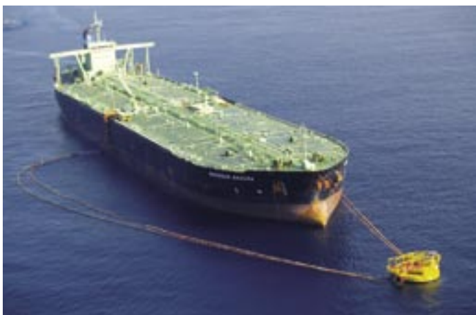
One of the main integrity-related projects in 2009 was the replacement of the single buoy mooring, through which about 77% of South Africa's crude oil requirement is imported.