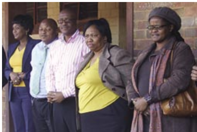
Minister of Education, Angie Motshekga, second from right, and other education officials address learners at the SAPREF-sponsored Winter School in Umlazi.

SAPREF runs a Saturday School at Velabahleke High School in Umlazi providing extra tuition in maths, science and English to Grade 12 learners. During the mid-year school holiday this year, it was decided to replace the Saturday School with a two week Winter School. On hearing of the programme, the Minister of Basic Education, Angie Motshekga, decided to visit the school to address the 250 learners who attended.